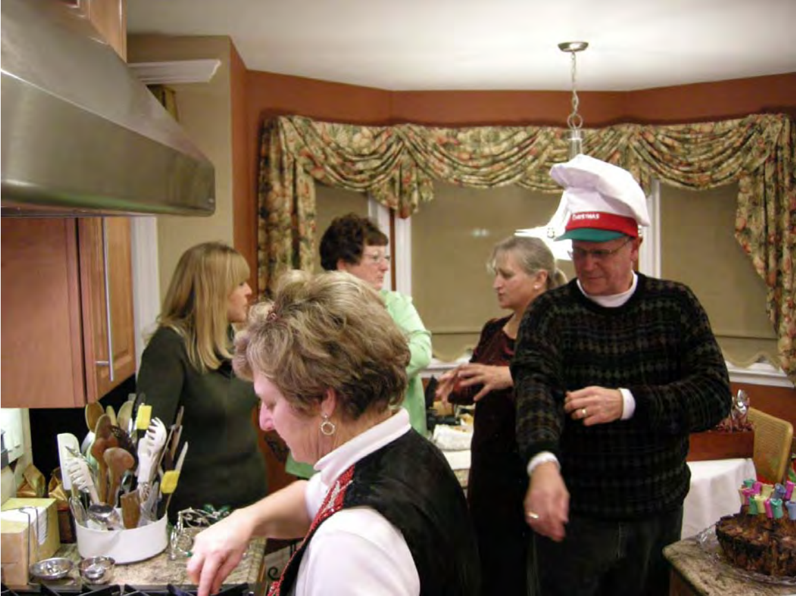
2007 Holiday Party at the Smiths