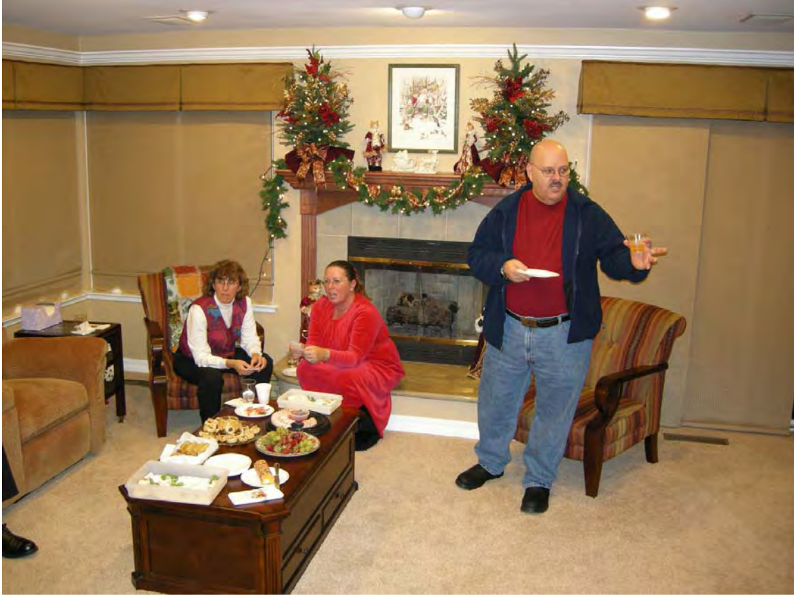
2007 Holiday Party at the Smiths