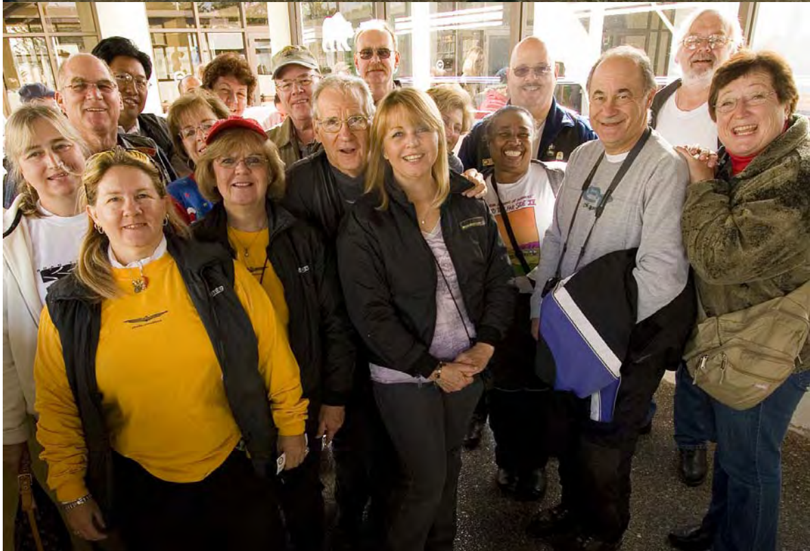
Hearst Castle Ride December 1 & 2, 2007