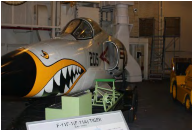
One of the F-11's that used to be on board.