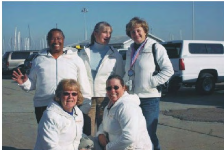
The Girls showing off their new Jackets