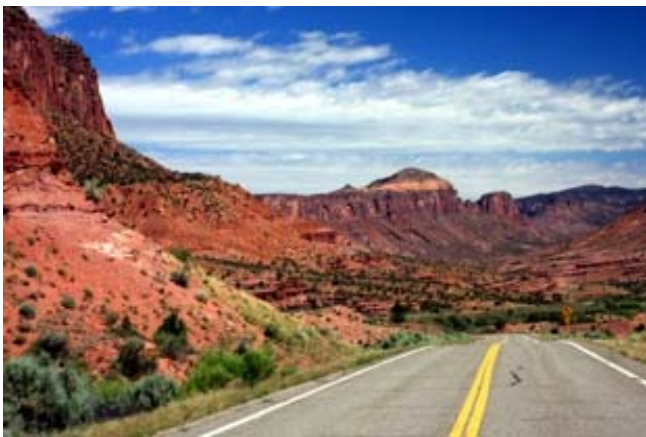
Just off of I-70 Heading South and West

Saturday we decided to ride back up to Grand Junction and take “The Grand Mesa Loop” Scenic Byway. A road that climbs above 11,000 feet and includes a ski resort, several snow parks, many many lakes and some stunning views of the valley far below. The road eventually brought us back to Delta where we returned to Montrose for Lunch. Saturday afternoon we rode the Deloris River Gorge through some stunning canyon scenery. A few more pics of the day →