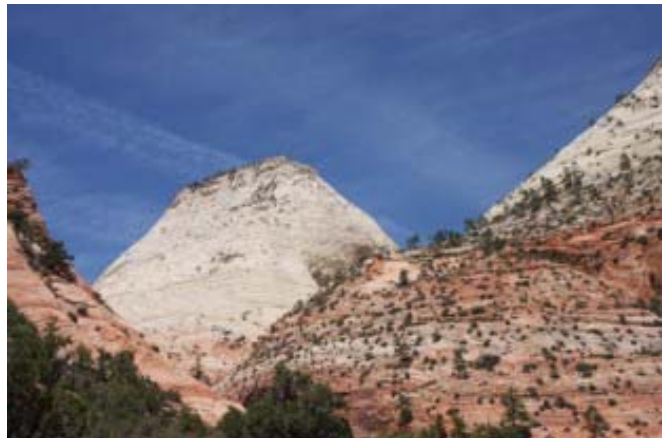
The "other side" of the Tunnel by US-89 (Zion)