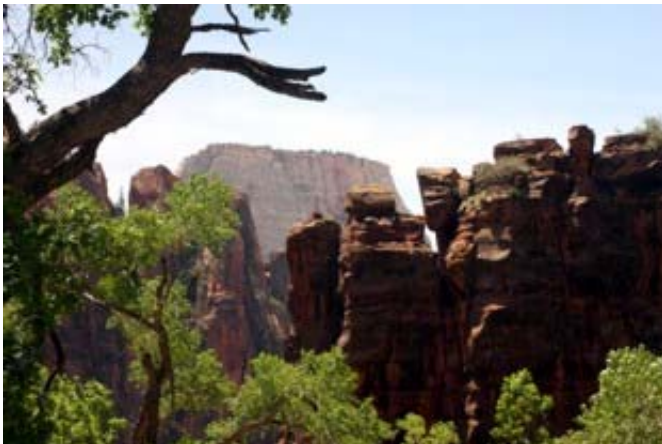
Side view of the Pulpit and the Alter (Zion)