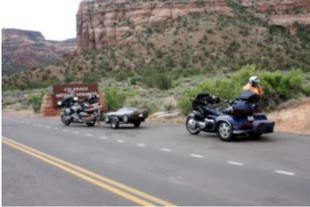
Entering the National Mon.