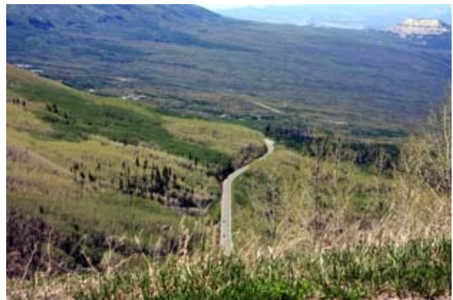
Nearing the top of the Grand Mesa Loop