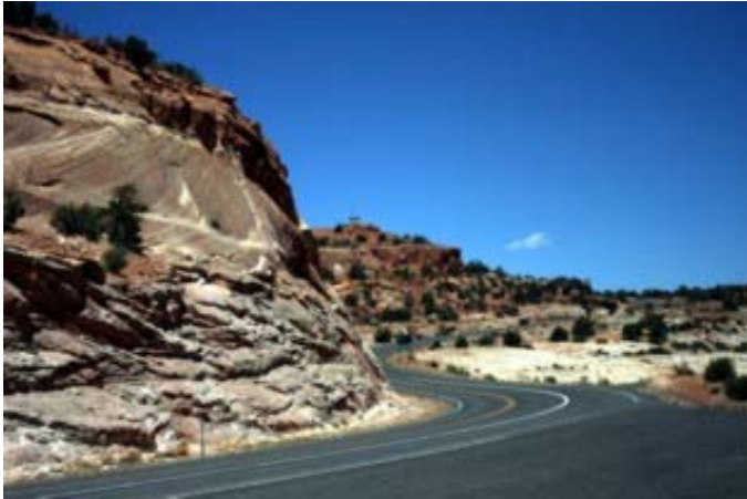
Some great twists and turns

and not wide enough to pull off on the shoulder to take them . We had to make do with the rare vista points and turnouts. It's definitely on my "Must ride" list for traveling through Utah.