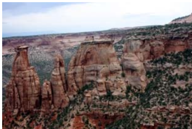
More – Gim'me More!

After departing the National Monument in Grand Junction we headed South on US-50 arriving in the little town of Delta just in time for a late lunch. Very hospitable little town and quite biker friendly. We continued south another 30 miles before arriving in Montrose and this years Rockies Gold. We got checked into our respective hotels and promised to meet a little later in the evening to walk around and kick some tires and tell some lies with the rest of the attendees. This year we were very lucky to have in attendance several couples from France as well as our long distance champ that came all of the way from Durban South Africa.