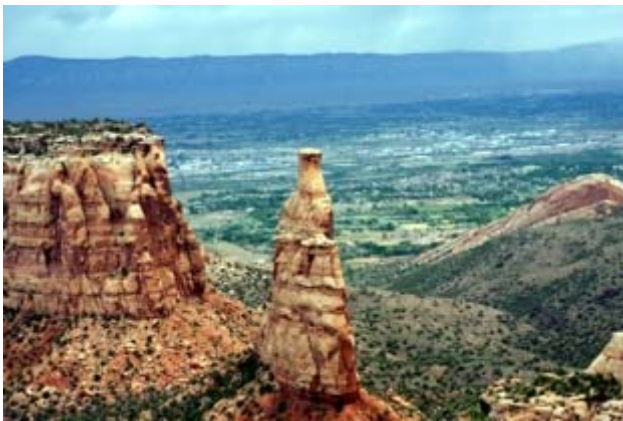
The Lone Sentinel