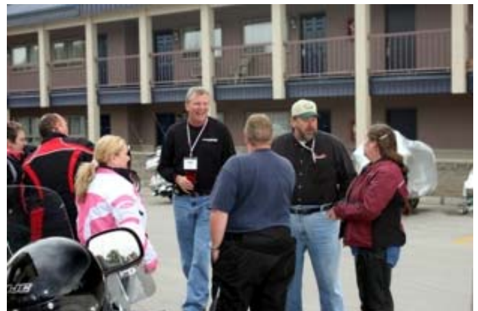
A few of the more than 300 Bikes there for the event. Meet and greet of the European Couples.