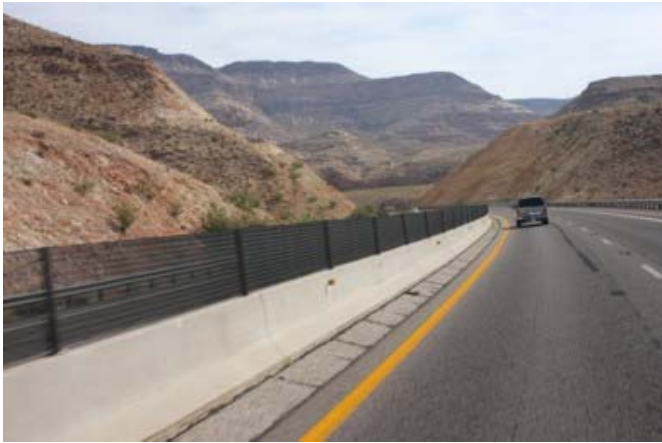
Virgin River Gorge along I-15