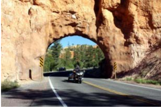
Me riding through the Red Rock park tunnel