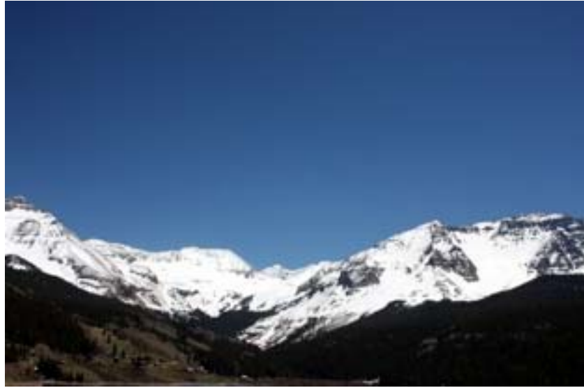
Heading into the San Juan River Gorge