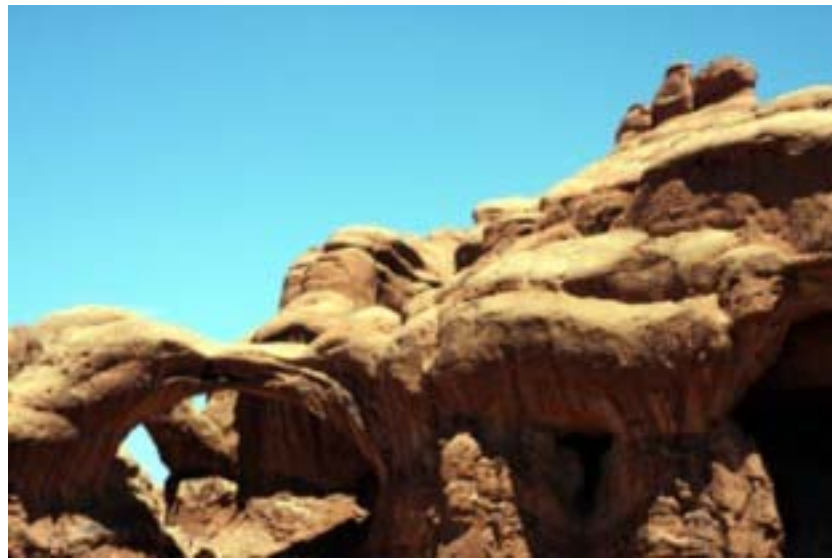
One of Many Arch Groups