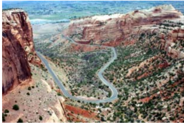
Yep – Nice MC Road !