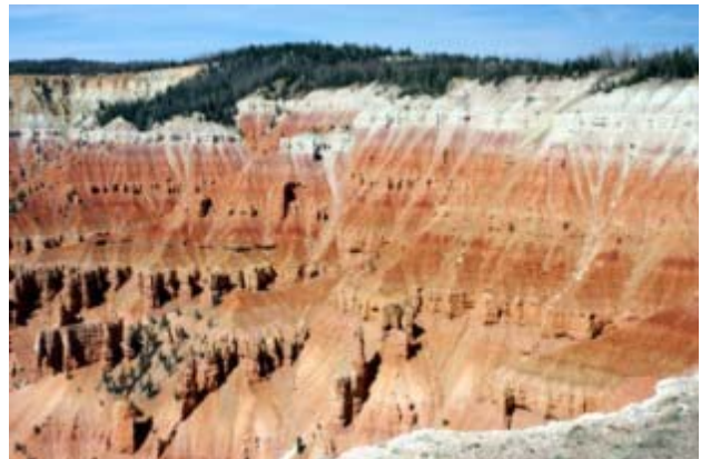
And the View from Pt. Supreme.