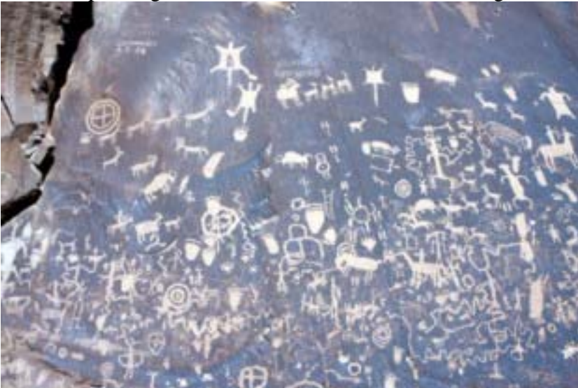
The Newspaper Rock - It's Big!

After spending several hours in the Arches we headed back into town and pulled into “Chips Tires” on North Main Street and he took a look at the tire on the trailer and said it looked like it was out of balance, and that it definitely should be replaced. So, he replaced it and balanced it and we proceeded to ride the rest of the ride with no other problems with it. Later that afternoon we decided to take a ride down to the Canyonlands National Park. What we didn’t realize is that the Canyonlands covers a huge area and the area we chose was intended for four wheel off road driving and lots of backpacking. So after an hour and a half ride through some pretty country we arrived to find that the best we could do is basically turn around and ride back. A couple of interesting stops were made – perhaps the most interesting one was at “The Newspaper Rock”. Ancient Indian Hieroglyphics -- The best Rich and I could figure out was that they were complaining about the heat and the lack of hunting.