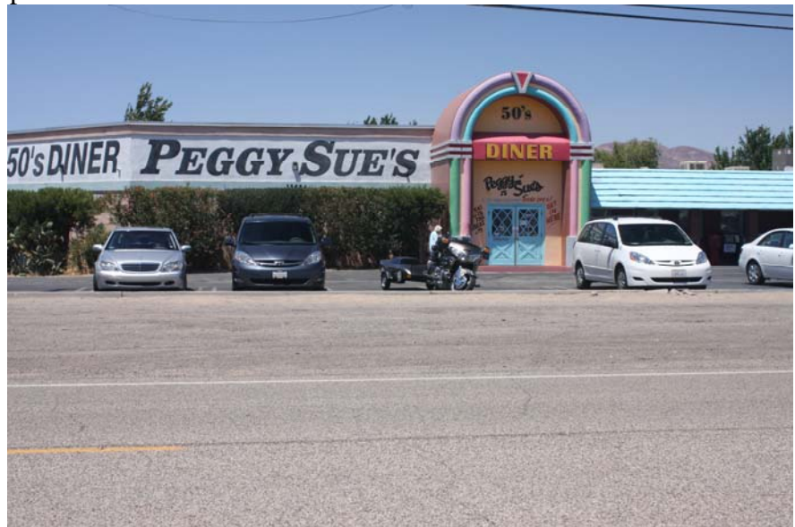
Peggy Sue's parking lot.

After lunch we got back on I-15 and headed East to Mesquite where we found our Best Western waiting for us. The ride into Mesquite was quite warm and by the time we were to pull off we were more than ready to go. Mileage for the day was 616 miles.