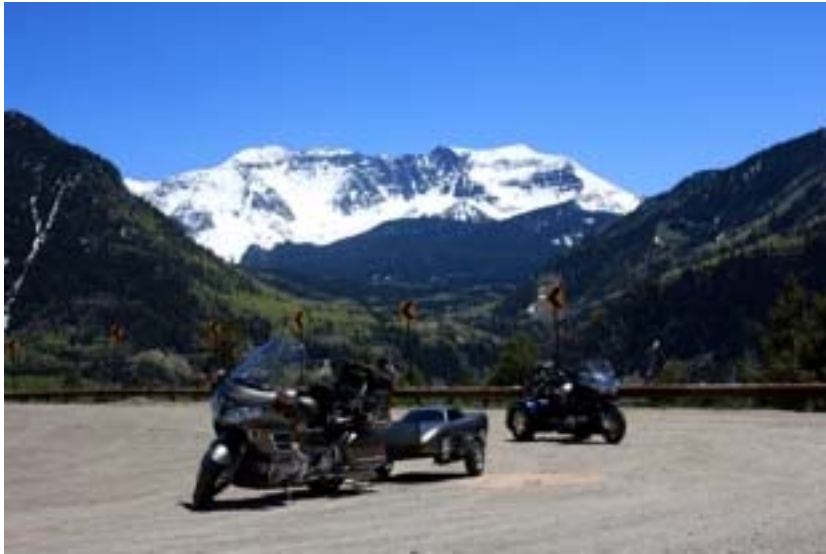
A little rest stop before heading back to the motel.