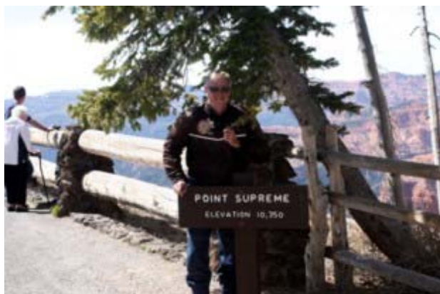
Your's truly at Pt. Supreme at Cedars Break