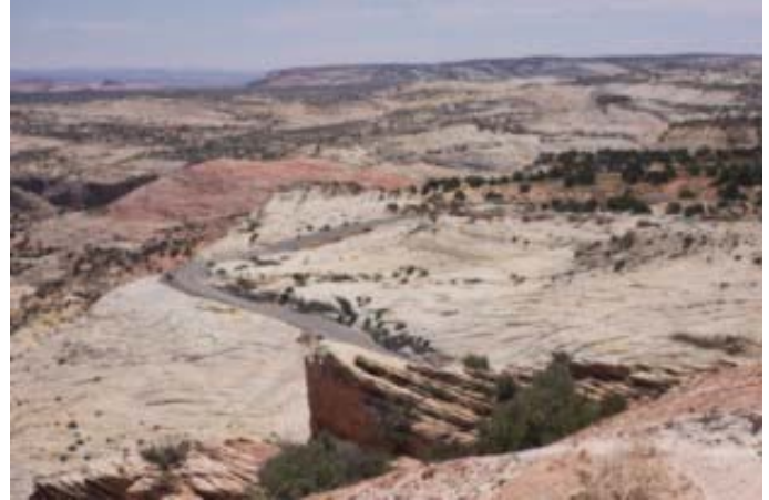
Hard to see, but the road is built on solid bedrock.