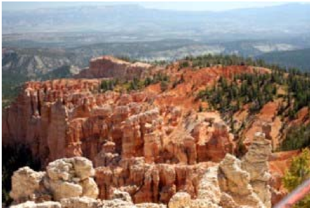
Just one of many stunning turnouts along the canyon rim