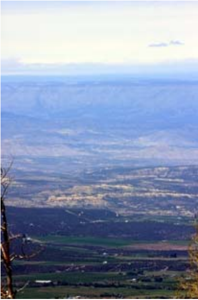
From the top Of the Loop.