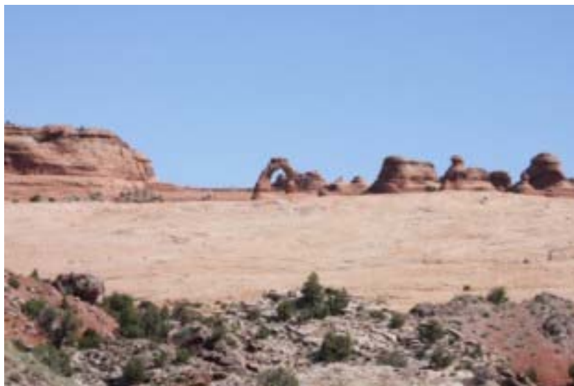
Delicate Arch – Can Hike to it over exposed Rock -- Usually over 100 Degrees –