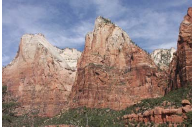
2 of the 3 Zion Sisters