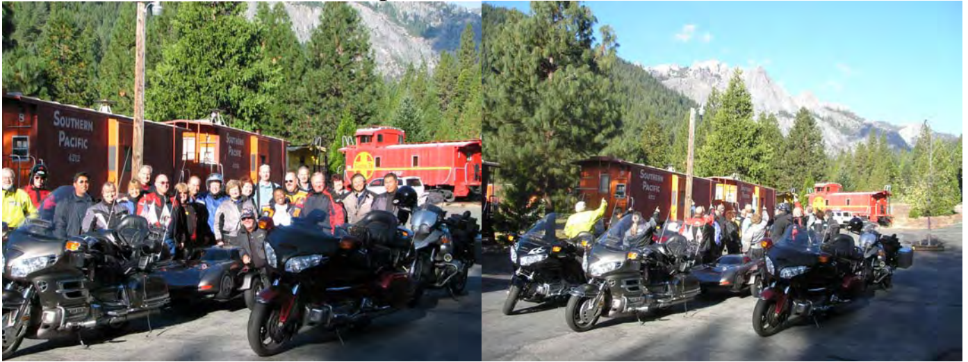
At the Dunsmuir Railroad Park