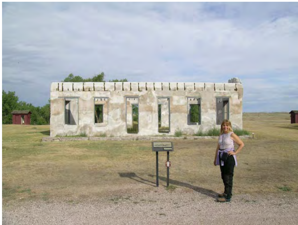
Fort Laramie ruin