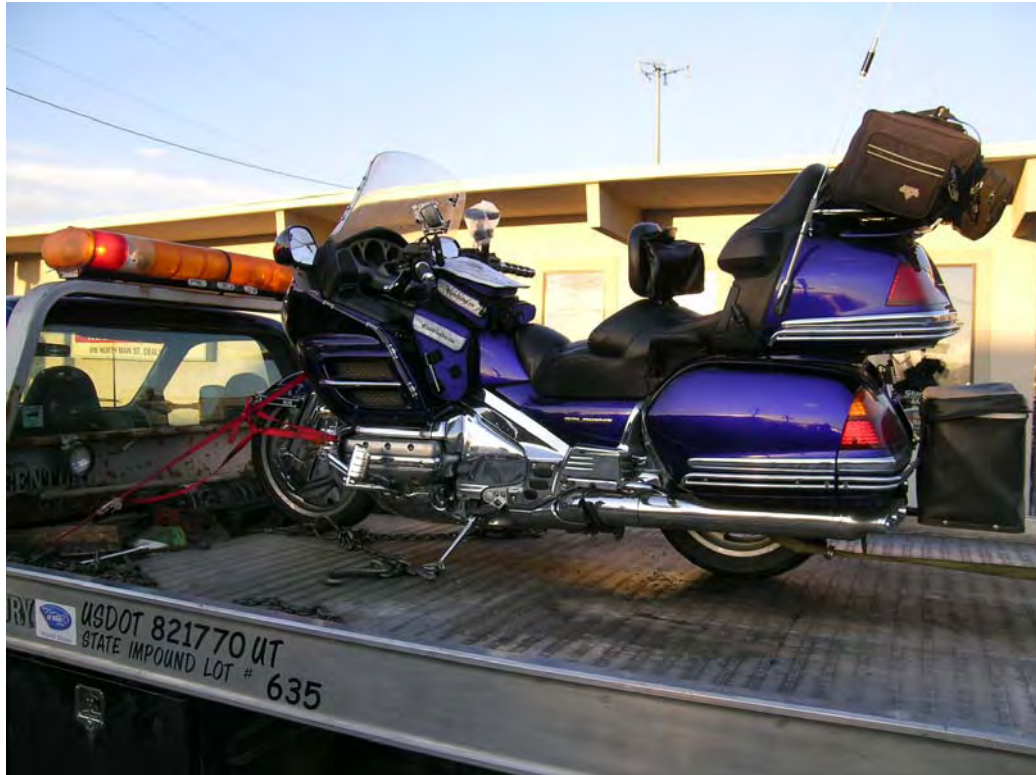
Our Goldwing is towed to Steadman's in Tooele, UT