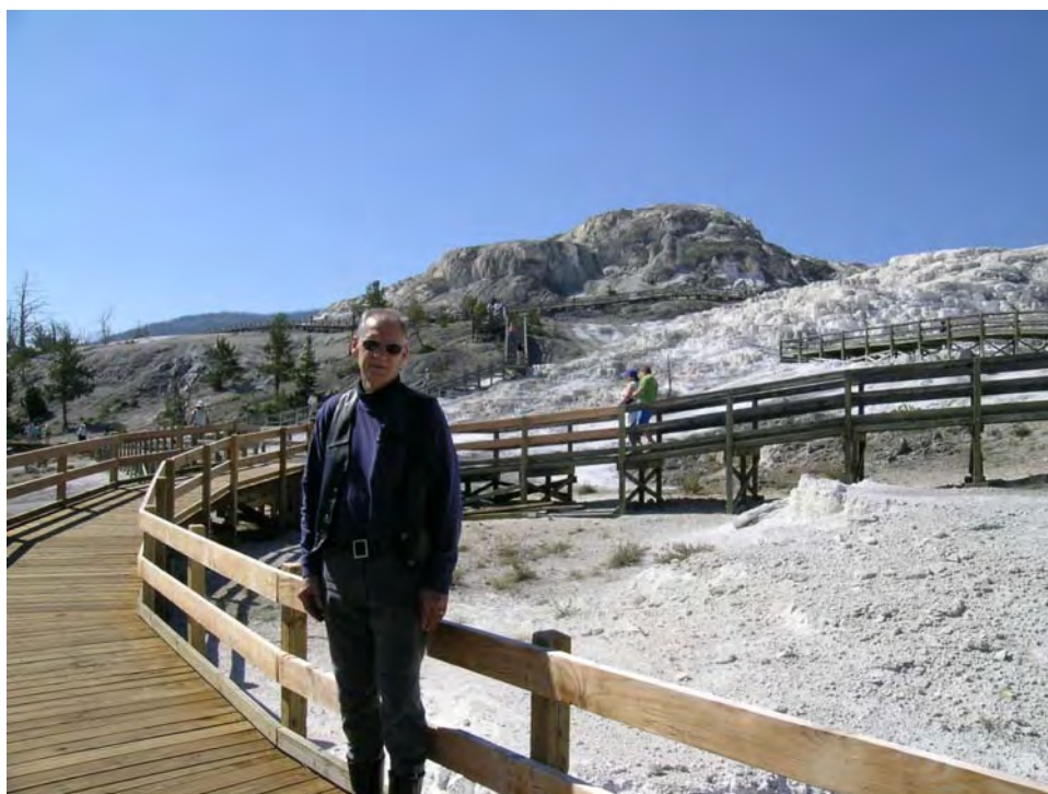
Yellowstone geyser trail