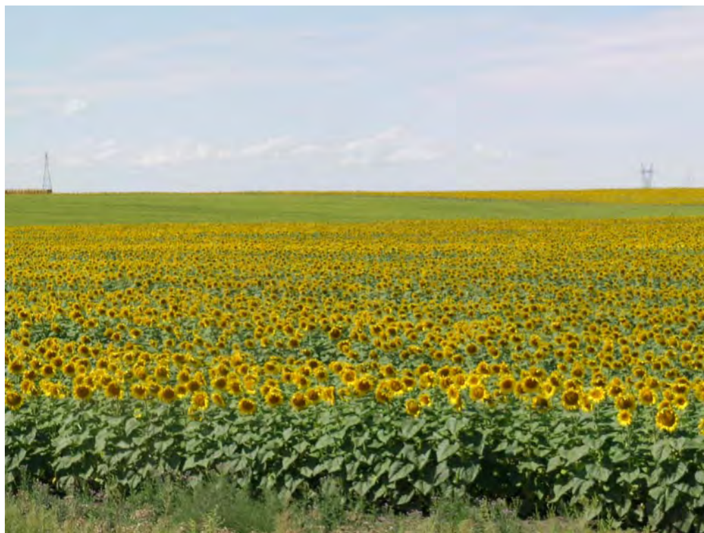
Thousands of acres of sunflowers somewhere along I-80 between Ft. Laramie and Kappenberger's