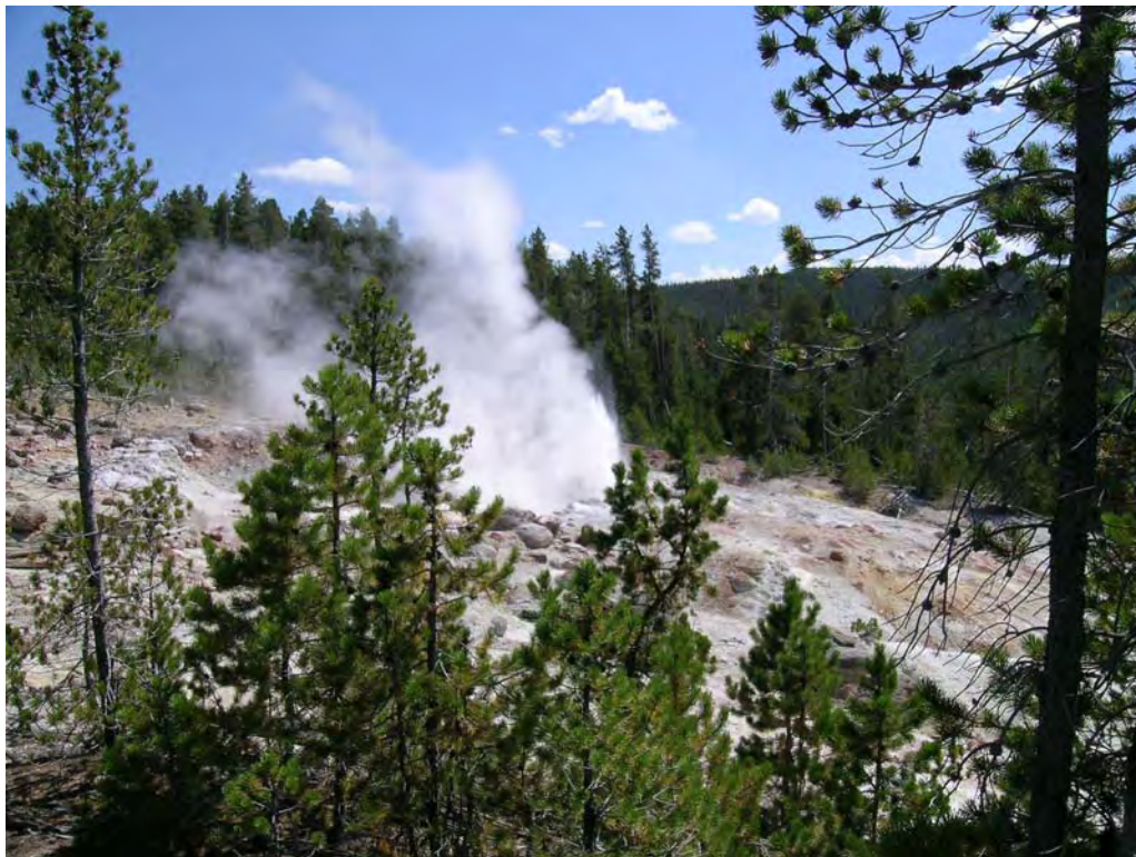
One of the hundreds of geysers in Yellowstone