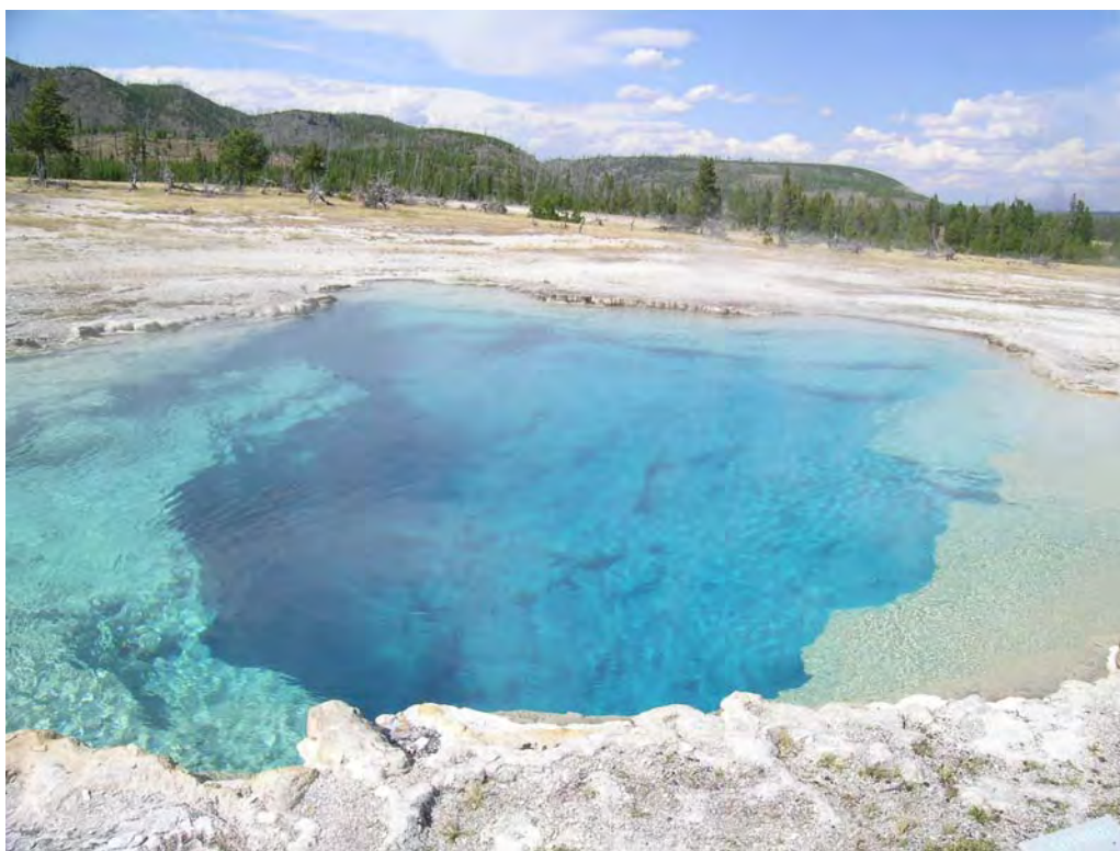
Sapphire Pool, the prettiest in the park