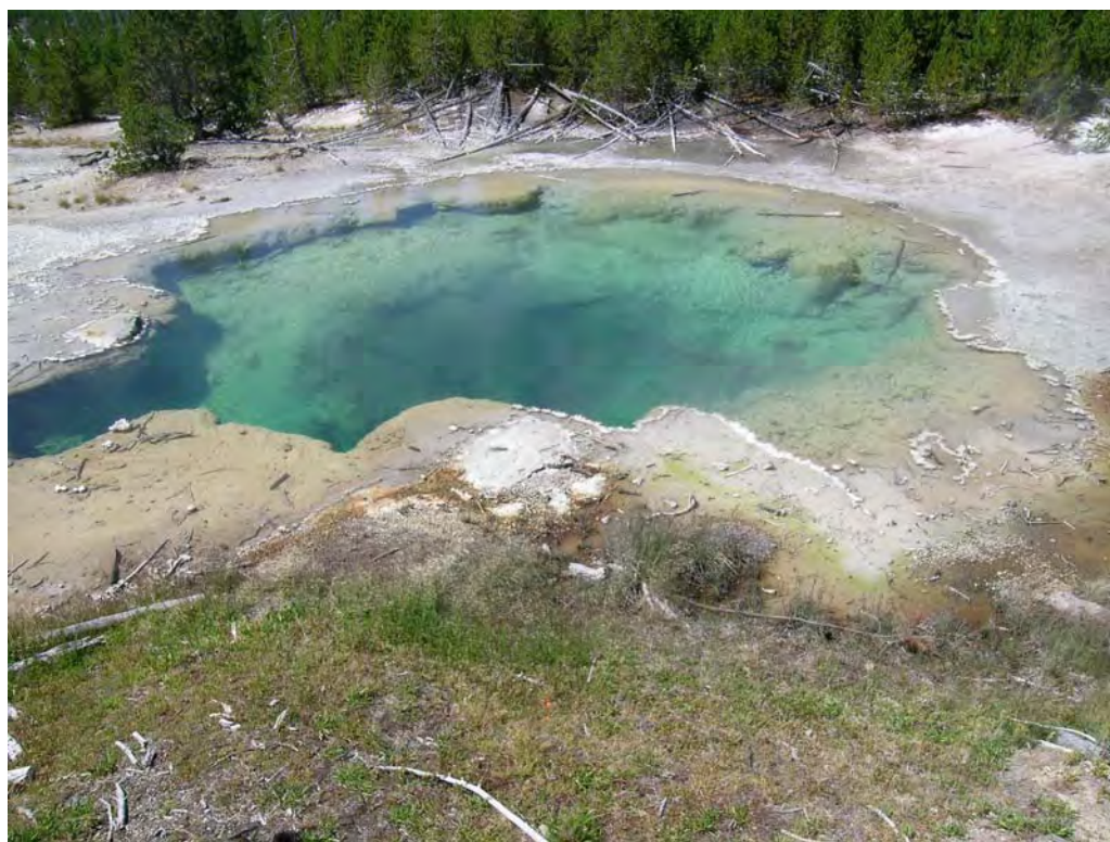
Boiling thermal pool