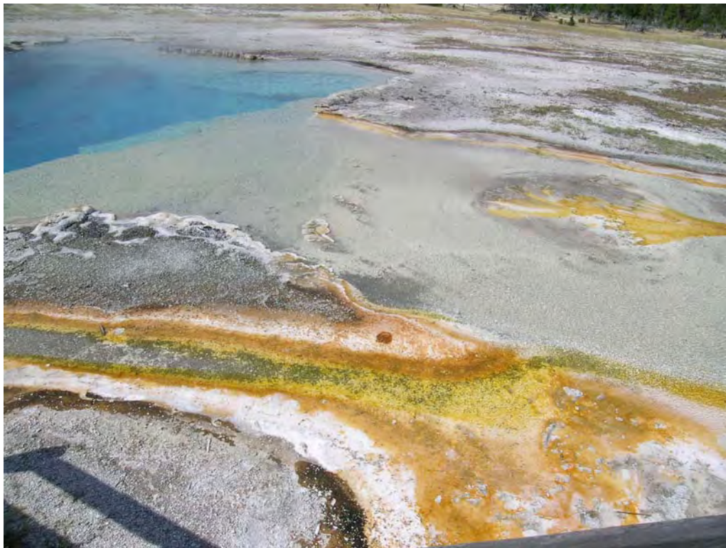
Colorful bacteria at the edge of a thermal pool