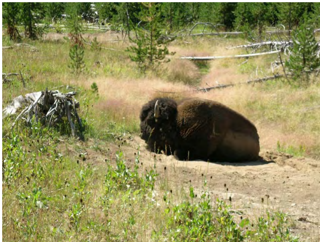
Lone Bison Bull