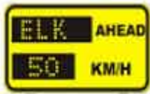
A lighted sign warns motorists of the animal's presence.

Anyway, during the last few years, my awareness of animals, particularly deer, has risen, as has my interest in avoiding them. This seems to have coincided with a general increase in the deer population nationwide and a resulting rise in collisions with deer. People spend more time in rural areas, since more people are moving out of cities. There is a deer-vehicle crash every eight minutes in Michigan. Of course, deer aren't only animals vehicles hit. During the past year, I have read of motorcycle collisions involving moose, bison, cattle, dogs, and other animals, but deer are the most common impact points. In a few areas, deer collisions outnumber all other accidents. About 150 Americans a year die as a result of 700,000 collisions with deer, which reportedly cause over a billion dollars in damage.