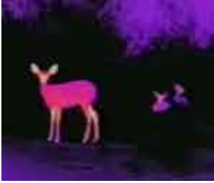
The deer detector "sees" animals using infra-red sensors.

Anyway, during the last few years, my awareness of animals, particularly deer, has risen, as has my interest in avoiding them. This seems to have coincided with a general increase in the deer population nationwide and a resulting rise in collisions with deer. People spend more time in rural areas, since more people are moving out of cities. There is a deer-vehicle crash every eight minutes in Michigan. Of course, deer aren't only animals vehicles hit. During the past year, I have read of motorcycle collisions involving moose, bison, cattle, dogs, and other animals, but deer are the most common impact points. In a few areas, deer collisions outnumber all other accidents. About 150 Americans a year die as a result of 700,000 collisions with deer, which reportedly cause over a billion dollars in damage.