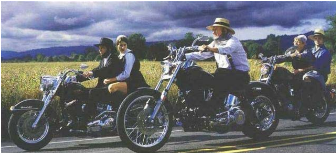
Amish gone bad