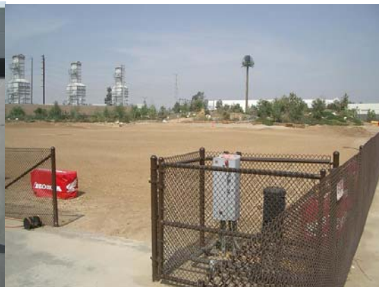
Off Road Training Range