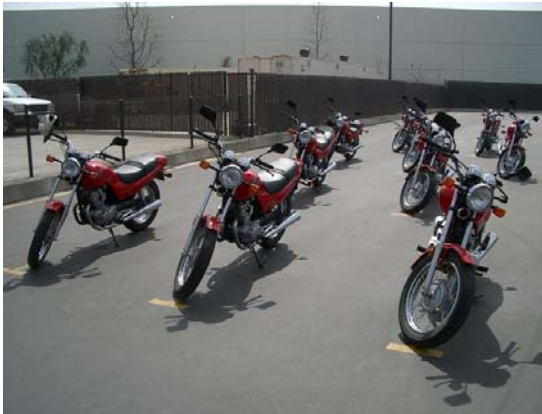
Honda 250 Nighthawks

The Training Center was first class, having both a paved, street riding training range, an off road training course and a fleet of training bikes, including dirt bikes and ATV's.