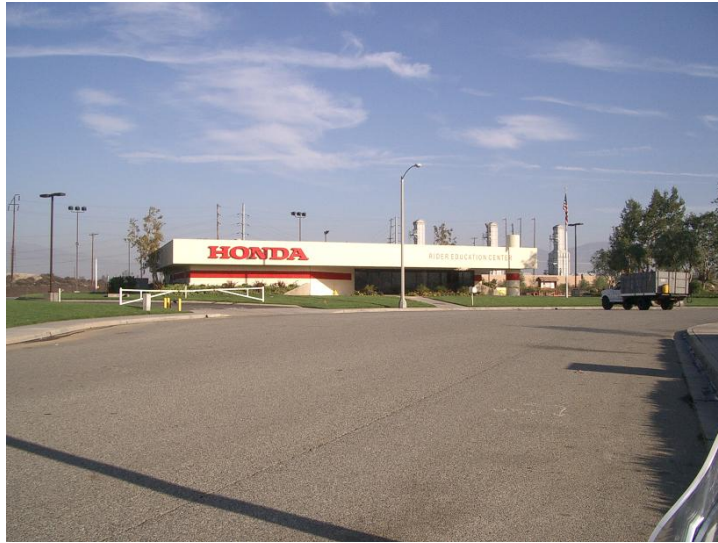
Honda Training Facility