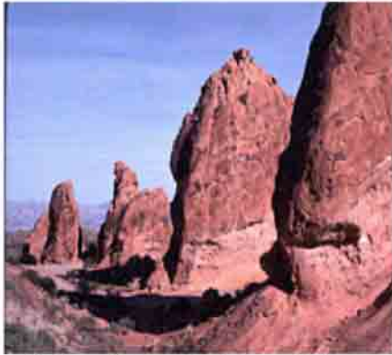
"Valley of Fire – The Seven Sisters"