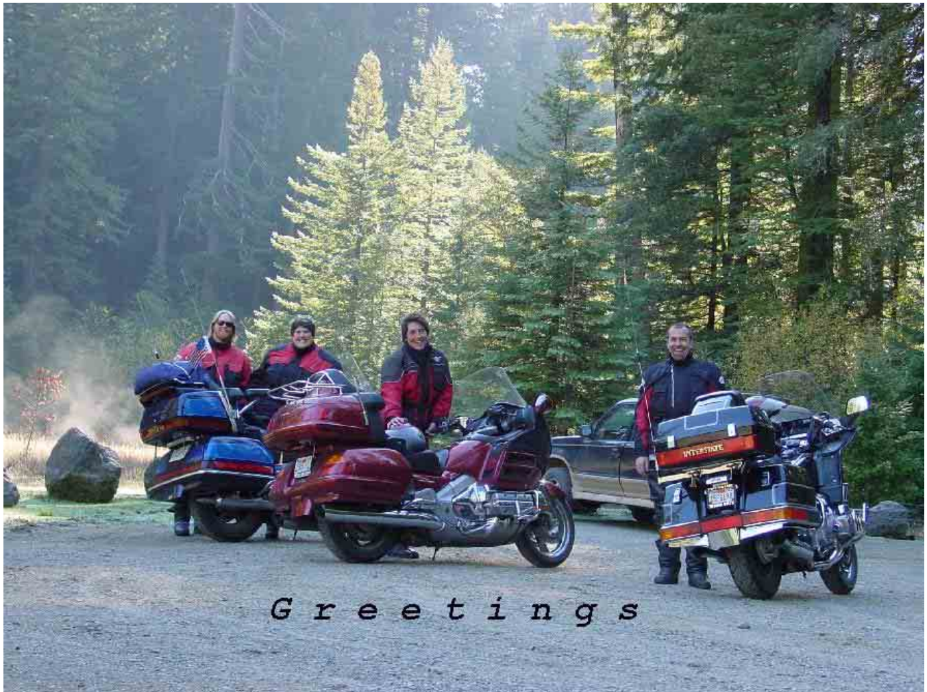
Browning's & Kappenberger's on Tour